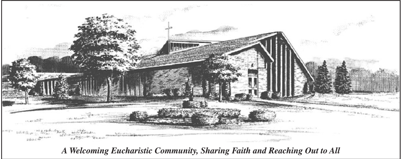
A Welcoming Eucharistic Community, Sharing Faith and Reaching Out to All

511 CHEAPSIDE ST., LONDON, ONTARIO N5Y 3X5 PHONE 519-433-6689 FAX 519-433-2301 E-MAIL: stmichlon@dol.ca www.stmichaelslondon.ca